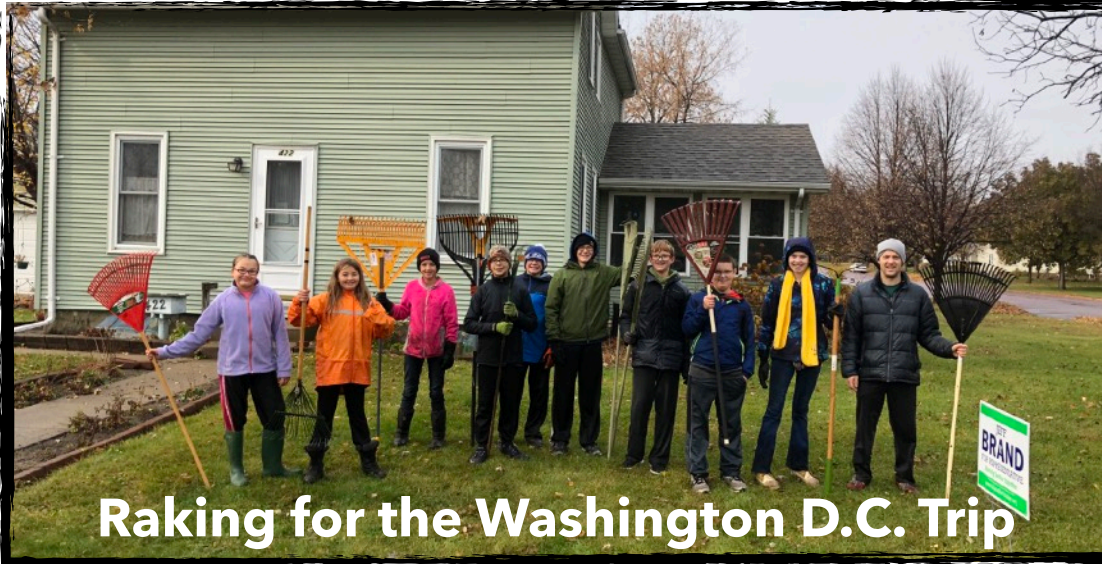
Raking for the Washington D.C. Trip